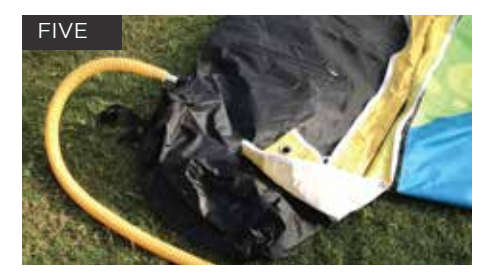
Connect the pump to selected Inflation Valve and begin inflation.

closed and leave cap off. On all other valves screw tight and fix cap.