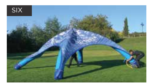
During the inflation process raise legs into the center until all legs are upright.