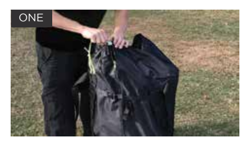
Unpack the marquee.

Recommended procedure below. For safety reasons it is recommended that 2 persons set up any marquee. Ensure area is free from any sharp objects & overhead objects.