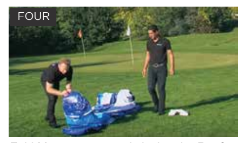
Fold Marquee up neatly laying the Roof and Legs on top of each other. Roll Marquee up.