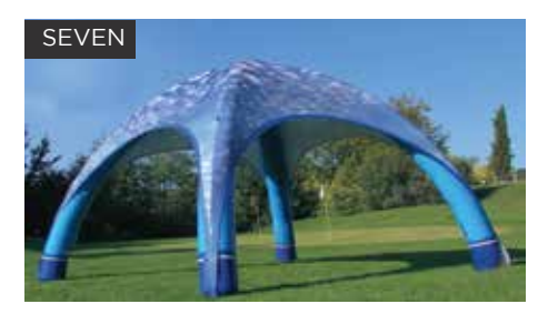
Ensure all legs are lined up and roof is centered. Check frame is firm.