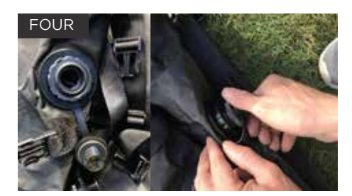
Each leg on the marquee has a valve. Select valve to attach pump, screw inflatation value closed and leave cap off.

closed and leave cap off. On all other valves screw tight and fix cap.