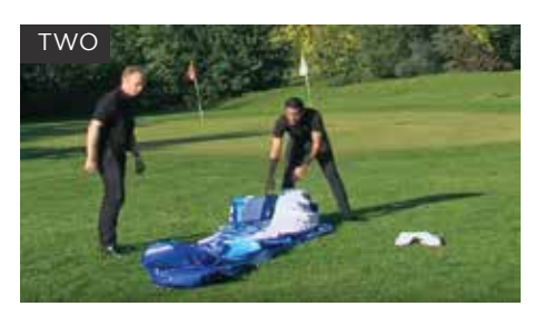
Roll out the marquee.