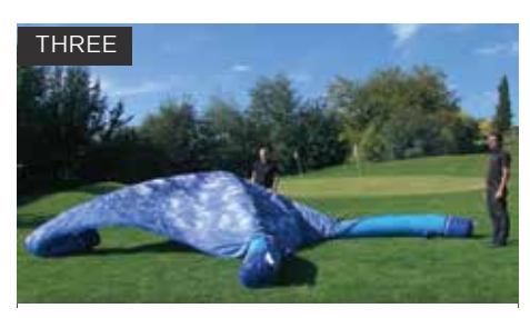
Remove all air from the tubes.