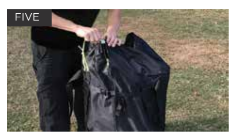
Pack the dry and clean Inflatable Marquee into Protective Cover.