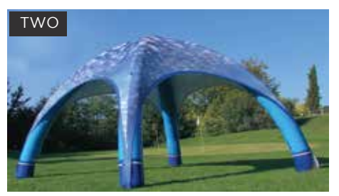
Ensure area is clear of persons. Ensure area is dry and clean. Unscrew all valves to deflate Marquee.