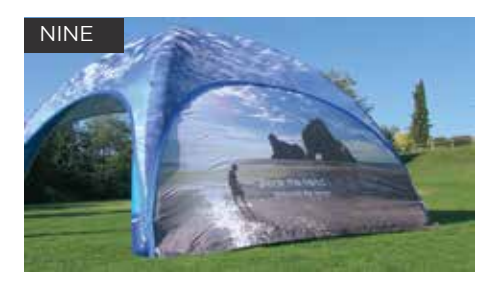
Ensure all walls are lined up and firm.